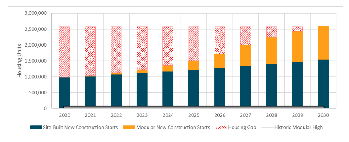
Figure 3. The number of site-built new-construction projects, manufactured homes, and modular newconstruction units, projected to 2030, showing the opportunity for meeting the targeted need for housing with modular construction (derived from U.S. Census data and Moody's Analytics projections of the housing deficit).

there are approximately 30 modular factories that serve the residential market, each builds, on average, 400 units a year. If modular construction were to ramp up to build enough housing to meet current and projected housing needs, in ten years the industry would need to substantially increase productivity in existing factories, and to bring online approximately 2,500 new factories with similar productivity rates. There would also need to be a massive shift from construction built according to current local codes to high-performance, all-electric construction and adoption of solar PV.